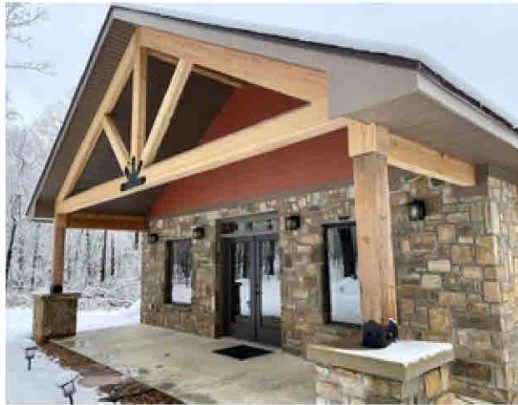
The retreat lodge at Camp Trinity