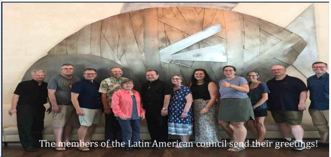
The members of the Latin American council send their greetings!