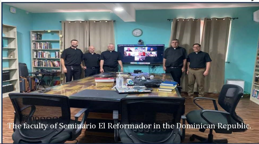
The faculty of Seminario El Reformador in the Dominican Republic.