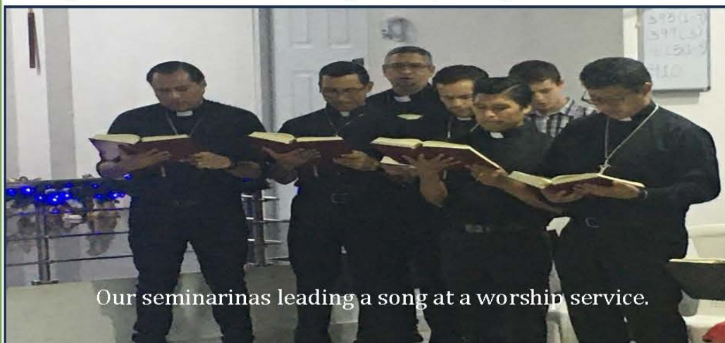
Our seminarians leading a song at a worship service.

All of our congregations celebrated Ash Wednesday with the imposition of ashes. These ashes remind us of our mortality and the need of repentance in our daily lives. May the Lord bless our churches throughout all of the world as they worship during this Lenten season.